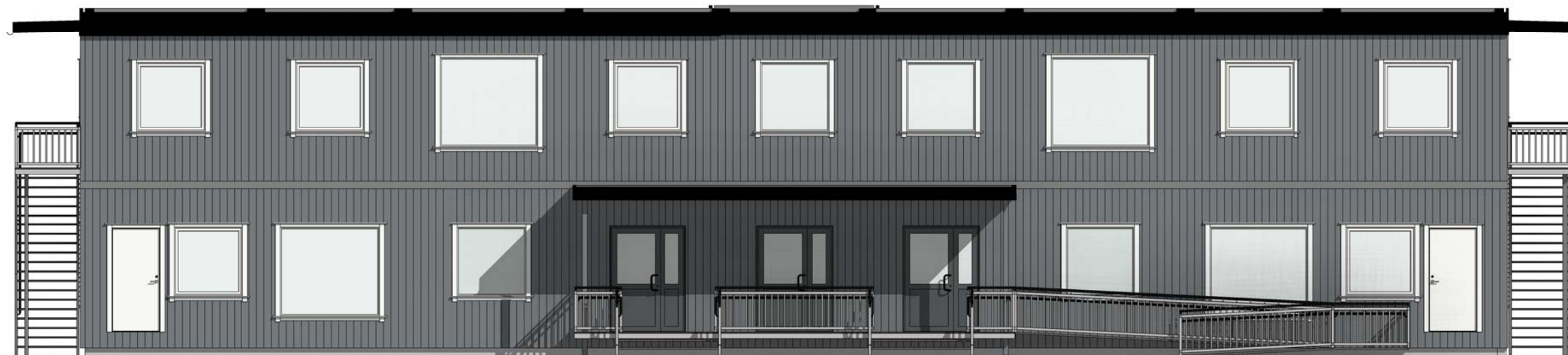
Sør 1 : 100