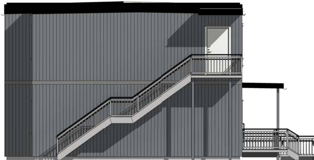
Øst 1 : 100